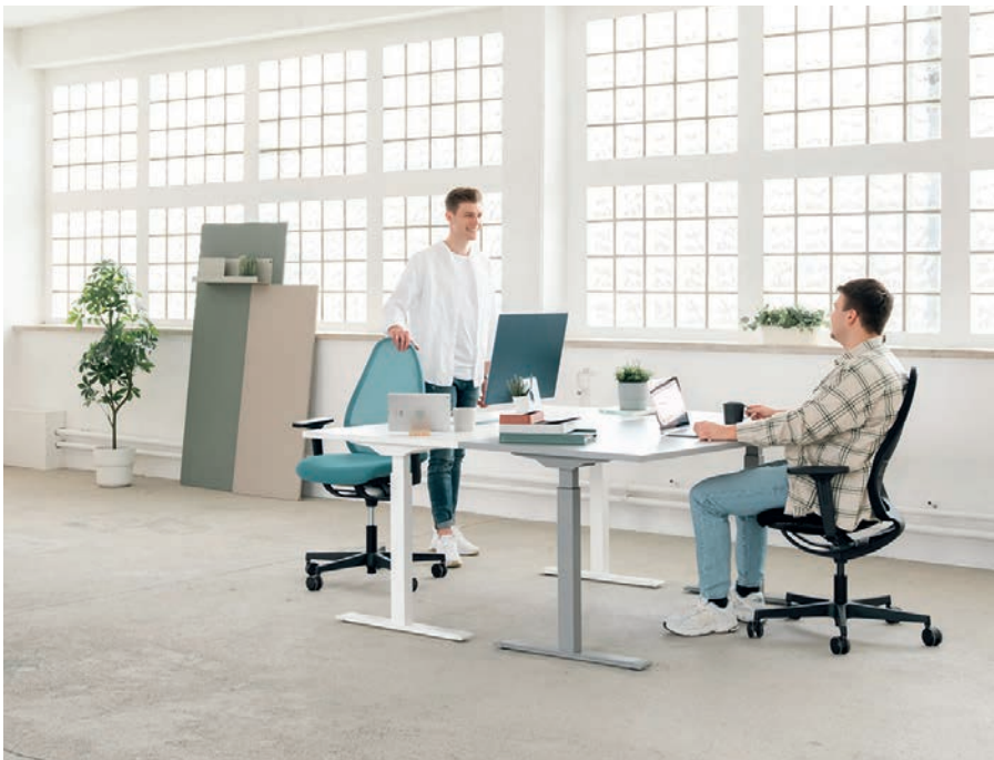
Soft Sitness Art

Fit and healthy while sitting - with Sitness technology from Topstar.